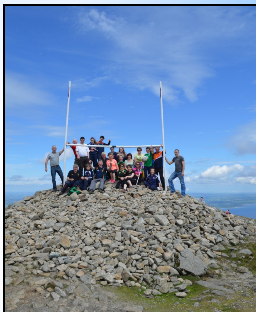
The team who kicked the "Highest Point" yesterday at the top of Slieve Donard

2016 will be a landmark year for the club in celebrating its 50th anniversary. Best wishes to the club on and off the pitch for the remainder of 2015.